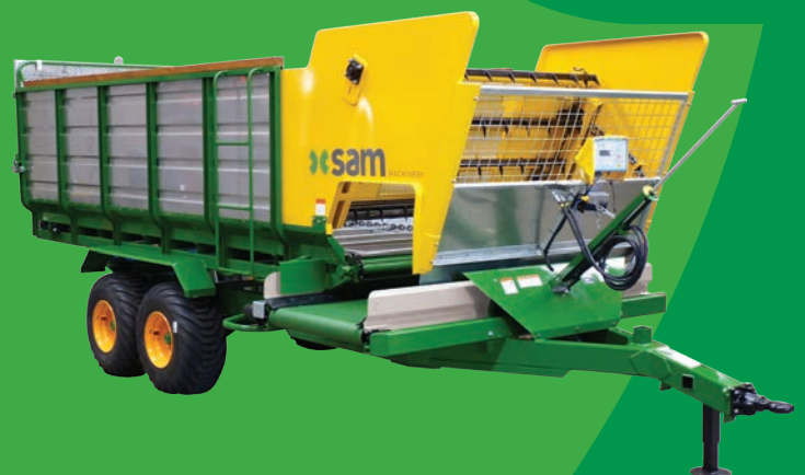
12m 3 Tandem-axle, Belt Side-Feed