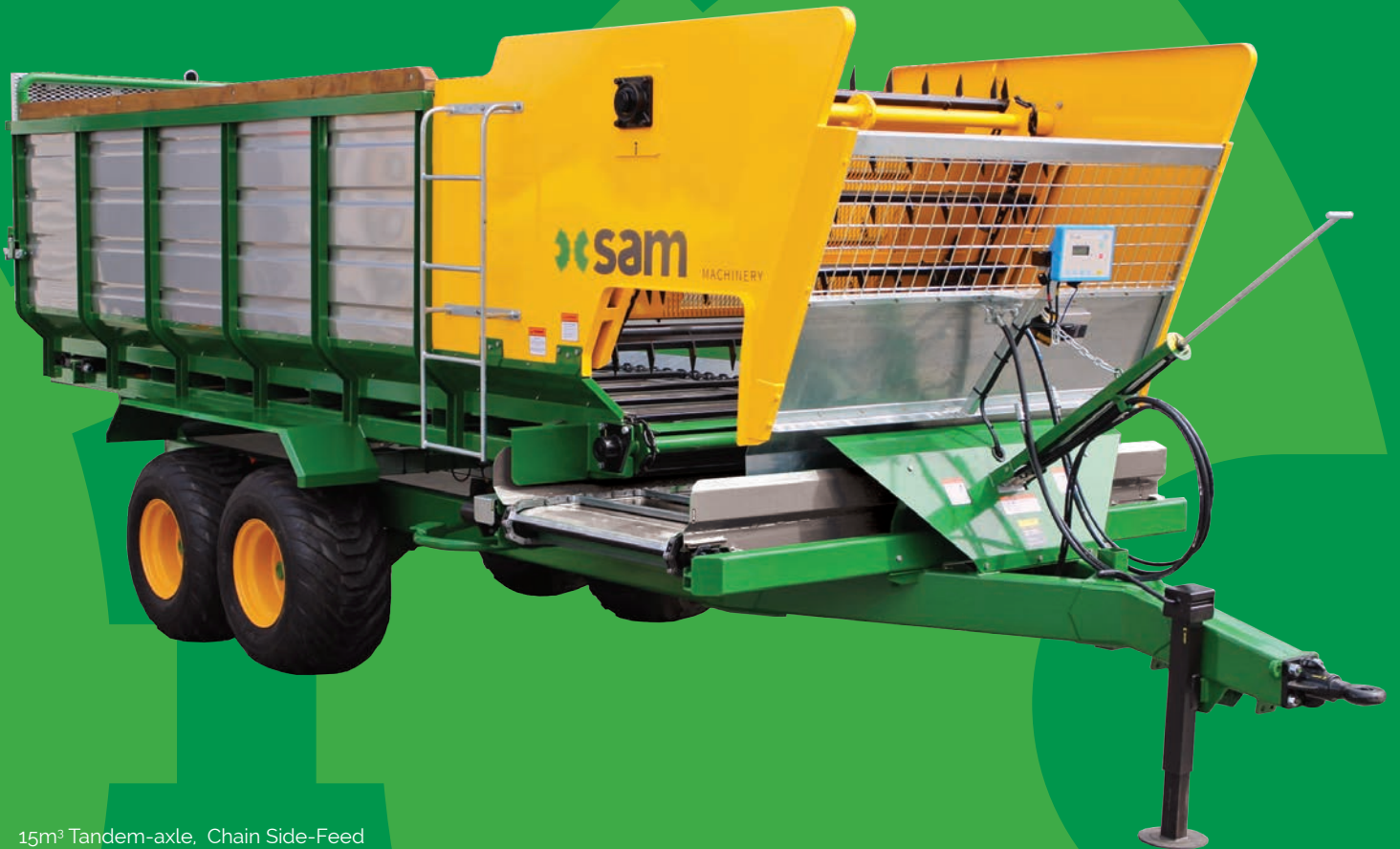
15m 3 Tandem-axle, Chain Side-Feed