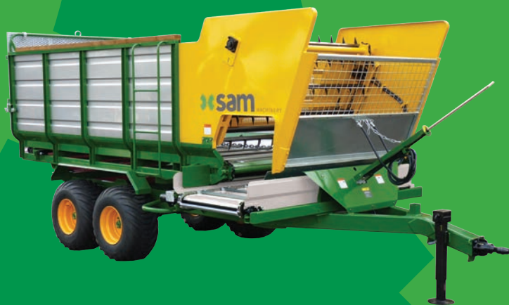
10m 3 Tandem-axle, Chain Side-Feed